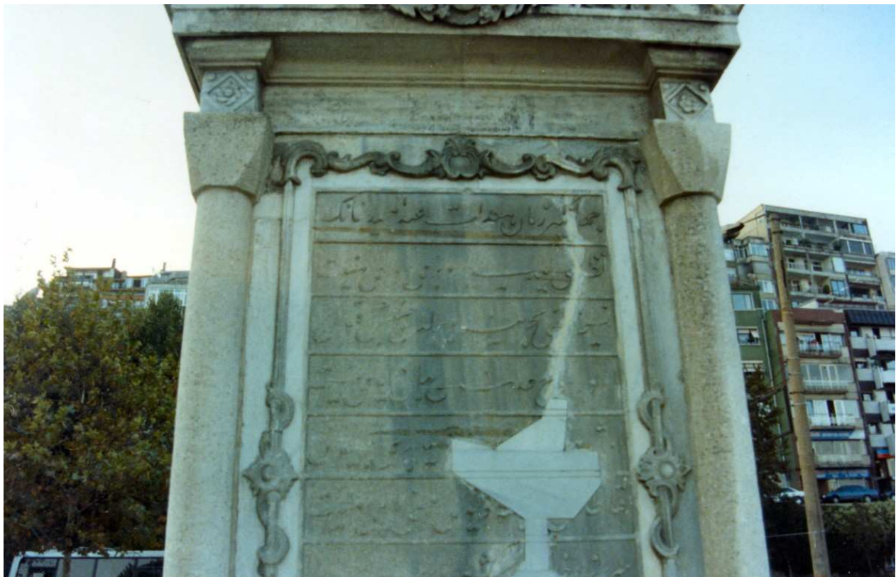
Fig. 2: Monument of Guru Nanak