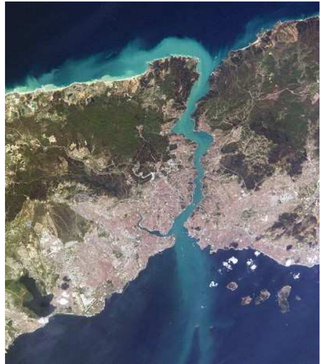
Fig. 1: Straits of Bosphorus (Bosphorus): Left side is Istanbul on European Continent, where the monument of Guru Nanak is situated. Right side is the end of Turkey on Asian Continent.

Meanings in Punjabi: ਜਮਾਨੇ ਦਾ ਮਾਲਕ, ਹਿੰਦ ਦਾ ਬੰਦਾ, ਰੱਬ ਦਾ ਨਾਨਕ । ( jamanay da malik, hind da banda, rab da Nanak )