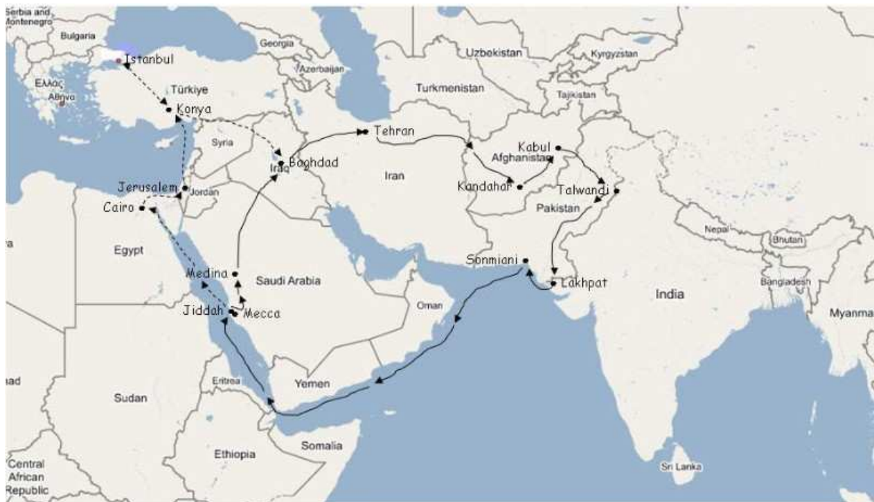
Fig. 4: Map of India and Middle East

Solid lines show the general accepted travel of Guru Nanak.